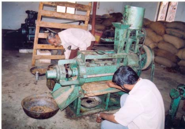
Oil Expeller for extraction of Pongam oil

Growing energy needs, coupled with increasing international oil prices, are forcing India to tap into renewable energy resources to address the energy crisis. The Government of India launched a national programme to promote the large scale cultivation of the plants Jatropha curcas and Pongamia pinnata for biodiesel production. However, the programmes are long term and need time to reach the farmers in remote areas. In addition, the current subsidy provisions for kerosene to those below the poverty line, diesel to fishermen and electricity at subsidized or free cost to farmers for irrigation are faced with inefficient public distribution systems leading to widespread shortage of energy resources in rural areas.