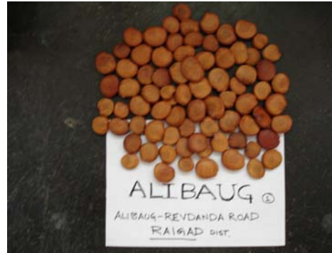
Variation within Pongamia seeds from Coastal and Arid Zones of Maharashtra India

According to Kaushik et al 2007, high genotypic correlation coefficient between pod and seed characters revealed that the traits are genetically controlled and selection can be very effective in tree improvement programmes of Pongamia pinnata . The study clearly indicates that considerable genetic differences existed in pod–seed morphological characters and oil content among various seed sources of Pongamia pinnata .