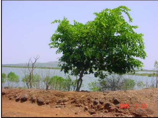
Pongamia along coast, India

Up to three-inch-long, pinnately compound, glossy green leaves are briefly deciduous, dropping for just a short period of time in early spring but being quickly replaced by new growth. In summer when all the other deciduous trees are leafless, Pongam in India is the most beautiful tree with bright green leaves and cool shade. In spring, Pongam is at its finest when the showy, hanging