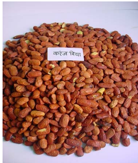
Dried Pongam seeds

To ease these barriers through the utilization of existing natural resources, the Applied Environmental Research Foundation (AERF), India has been working since 2005 to set up village/cluster level biodiesel resource centers to meet local energy demands in Alibaug and Mhasala blocks of Raigad district of Maharashtra. In 2007, through Global Actions Programs Fund provided by the Global Village Energy Partnership (GVEP), the AERF reached over 70 villages with a potential to create income generating opportunities through Pongamia seed collection activities and employment at the resource centers ( Rai & Sarnaik 2009 ).