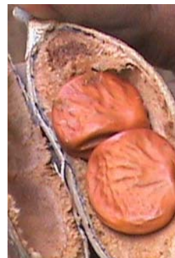
Pongamia pod with two seeds AERF Collection from Coastal Maharashtra.