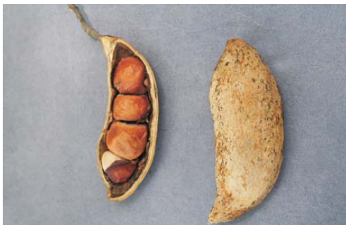
Pongamia pinnata (VNK-P 113), Unique accession with high seeds/pod from Vizianagaram district, Andhra Pradesh (Source : DARE/ICAR Annual Report 2007-2008)

The ovaries of P. pinnata mostly contained two ovules (95.04% of the flowers) and occasionally three (4.96%), with a mean of 2.05 \pm 0.22 ovules per ovary (N = 121). A majority of the pods (90%) had only one seed ( 1.10 \pm 0.42 ; N = 267). In Pongamia pinnata only one of the two ovules develops into a seed in most of the pods. Since pollen was not found to be limiting and reduced fertilization could not completely explain the observed frequency of seed abortion, it implied an effect of post fertilization factors.